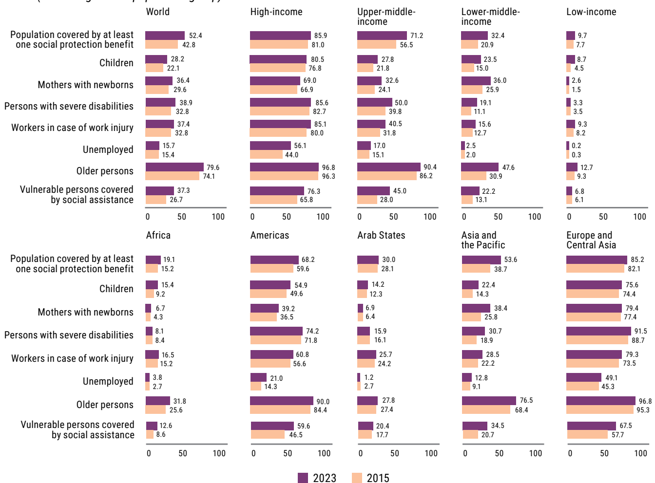
Figure 1. SDG Indicator 1.3.1: Effective social protection coverage, global, regional and income-level estimates, by population group, 2015 and 2023 (Percentage of the population group)

of spending. Countries spend on average 19.3 per cent of their GDP on social protection (including health). This figure hides wide variations: high-income countries spend on average 24.9 per cent, upper-middle-income countries 11.8 per cent, while lower-middle-income countries spend only 5.8 per cent, and low income countries 2.0 per cent of their GDP. Analysing the structure of social protection expenditure shows that globally, the bulk of total social protection spending is devoted to old-age pensions (38.7 per cent) and healthcare (33.0 per cent). The remainder is distributed among benefits for the working-age population (24.6 per cent) and children (3.8 per cent).